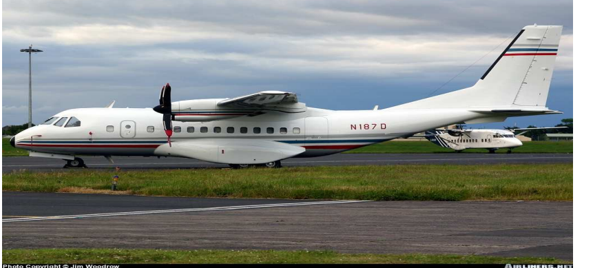
Aircraft at Edinburgh en-route to the US from Seville

Brief History: Up until the flight north-bound the aircraft operated for the first part of the year in Kabul.